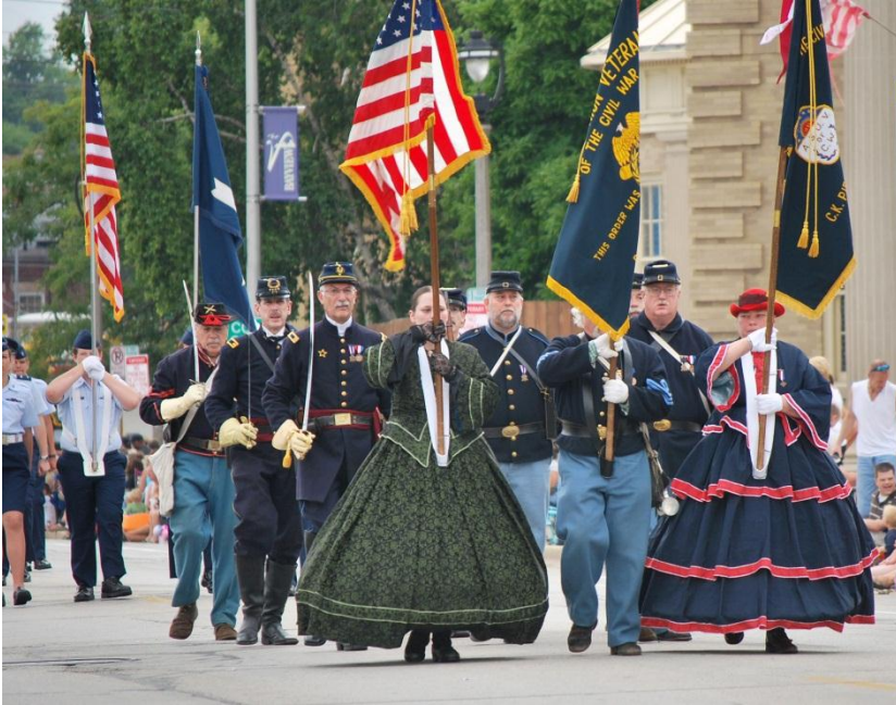
The Company and members of C.K.Pier Badger Camp 1 and Aux. 4 march in the South Shore Frolics Parade.

During the Summer, members of the Headquarters Company marched in four parades and manned information booths at several events. The Company marched at the head of the Civil War division of the Positively Patriotic Parade in June. The parade kicked off the 10th annual Reclaiming Our Heritage event at Milwaukee's VA Medical Center. In July, the company hit the pavement again during the 62nd annual South Shore Frolics Parade, which ended on the shore of Lake Michigan. On Labor Day Weekend, the company trouped for crowds at the annual St. Francis Days Parade. A week earlier, the men served as a color guard and manned a Sons & Auxiliary information booth at the West Allis Settlers Weekend.