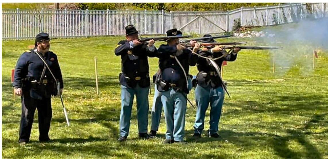
Above: Turner Brigade Spring Drill (Apr. 20, 2024)