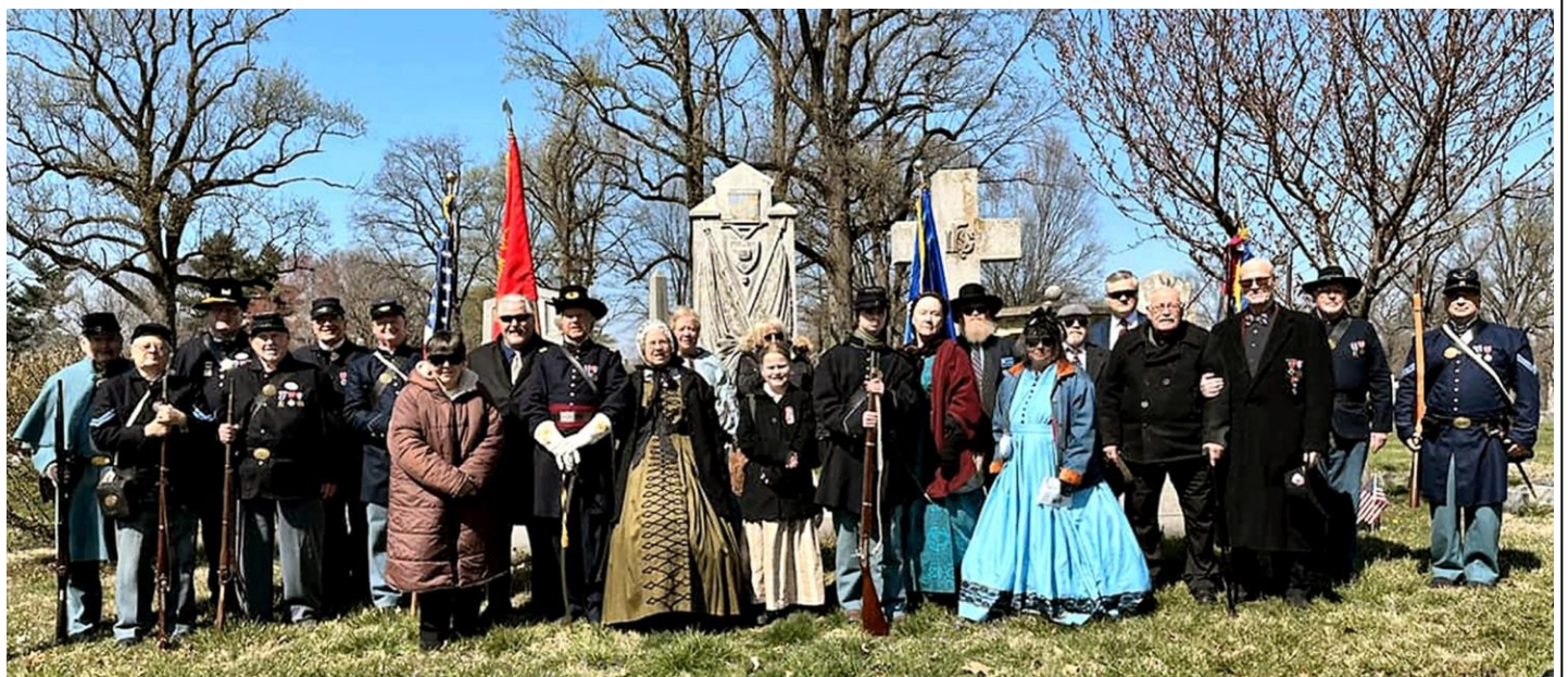
Below: Sherman Day Ceremony (March 24, 2024) with the 2nd Regiment, Missouri Infantry and Co. A (1861) Company M, 1st Missouri Light Artillery.