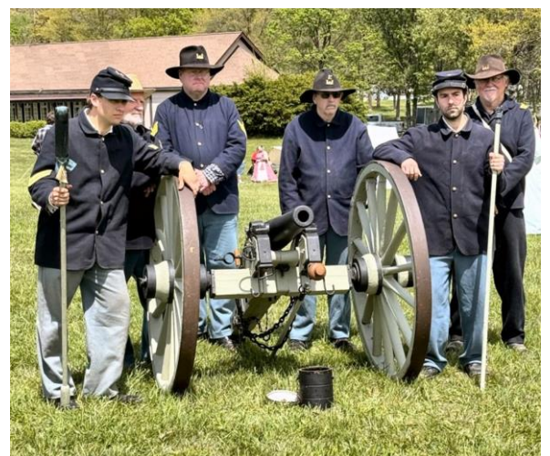
Turner Brigade Spring Drill (Apr 20, 2024) with "George" the cannon