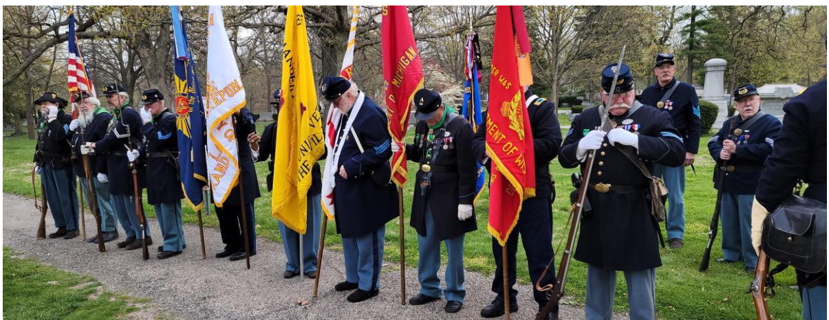
Bottom: The Honor Guard for the ceremony falls in. Soldiers from the 4th District fell in with the help of the 3rd District, the Iron Brigade Guard, and the 2nd MO Infantry.