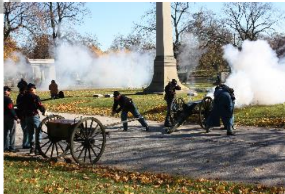
Firing the salute at Veterans' Day