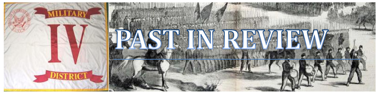
Volume 7 Number 1