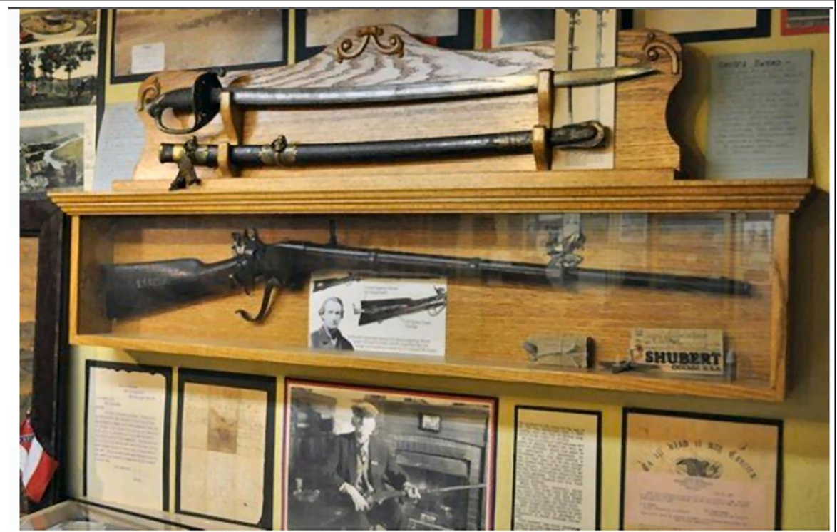
Colehour survived the Civil War partly because his unit was one of the few with the Spencer rifle, which allowed soldiers to reload while lying down, rather than the usual method of standing up to reload a musket. Prospect House Museum