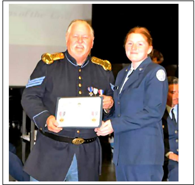
1st Missouri Light Artillery, Company M